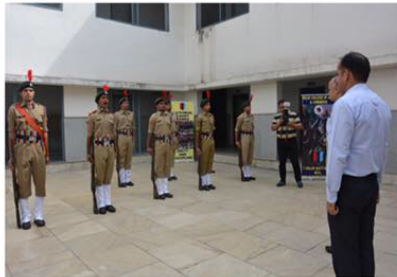
DCAC NCC COMPANY GUARD GIVING GUARD OF HONOUR TO DELHI DEPUTY CM, SHRI MANISH SISODIA.